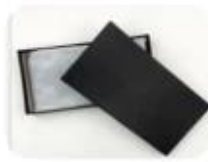
10.1 Package (polybag, cotton bag, gift box for your choosing)