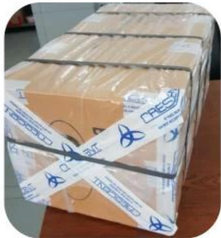
12.1 Final Packaged in Carton