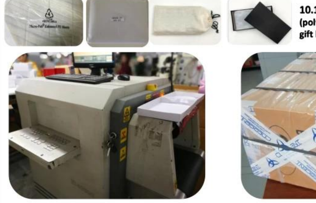
11.1 Finished Products Metal X-ray Detector