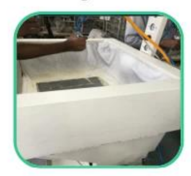
Glue Machine for Lining