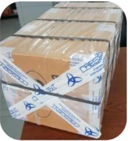
10.1 Package (polybag, cotton bag, gift box for your choosing)