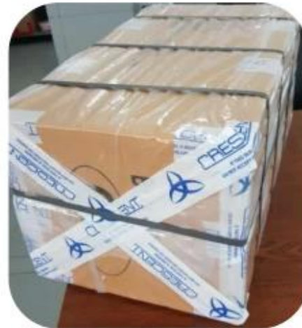
12.1 Final Packaged in Carton

Totally approx 28 QC workers, 4 QC steps to Guarantee the Quality