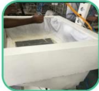
Glue Machine for Lining