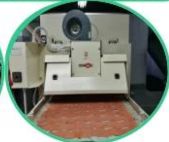
Glue Machine for Leather