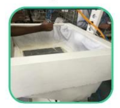
Glue Machine for Lining