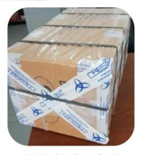
12.1 Final Packaged in Carton