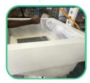
Glue Machine for Lining