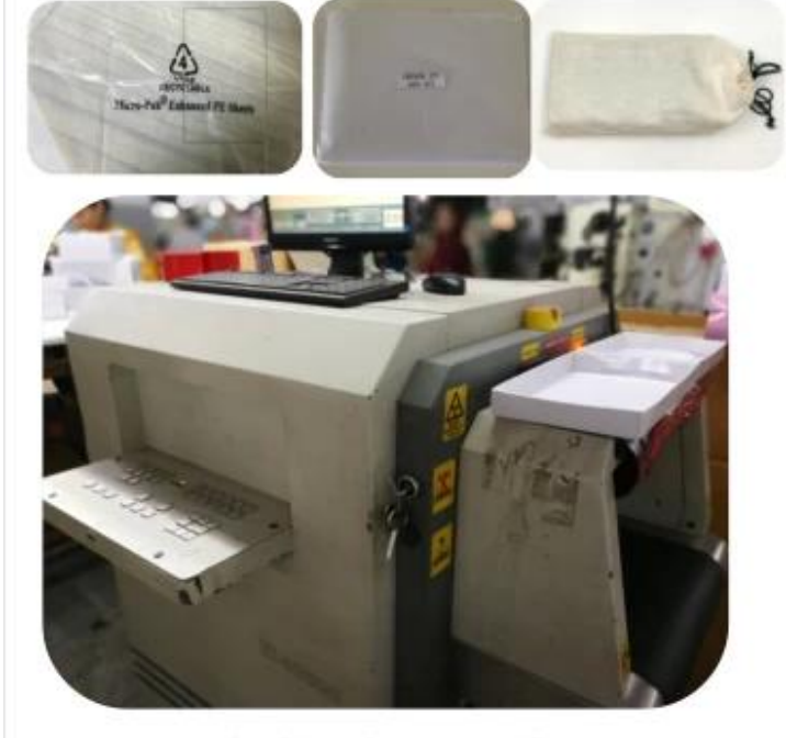
11.1 Finished Products Metal X-ray Detector