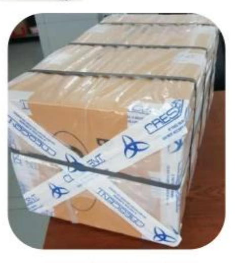
10.1 Package (polybag, cotton bag, gift box for your choosing)