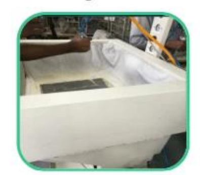
Glue Machine for Lining