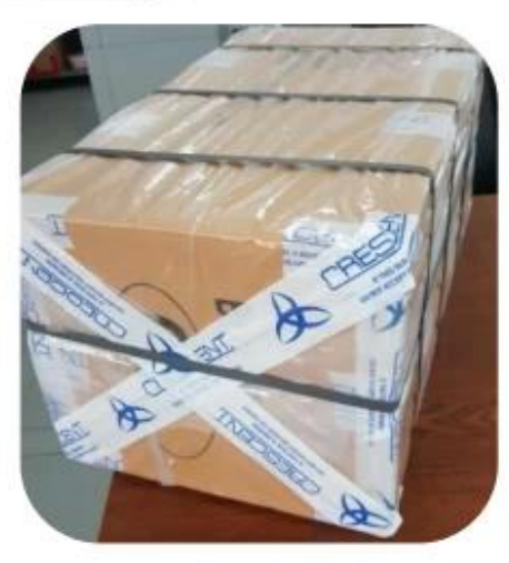
12.1 Final Packaged in Carton