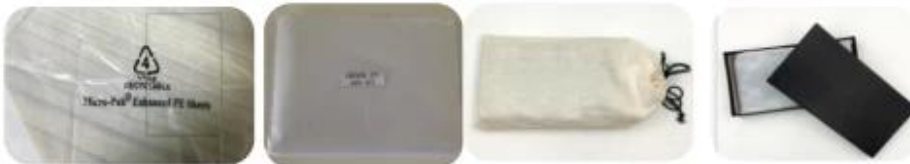
10.1 Package (polybag, cotton bag, gift box for your choosing)