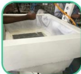
Glue Machine for Lining