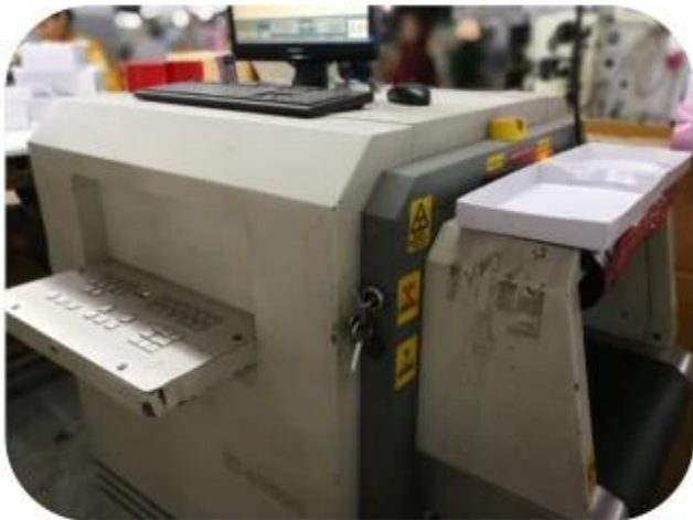
11.1 Finished Products Metal X-ray Detector

10.1 Package (polybag, cotton bag, gift box for your choosing)