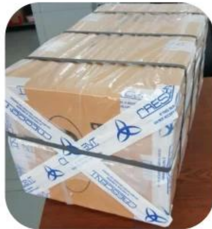
12.1 Final Packaged in Carton