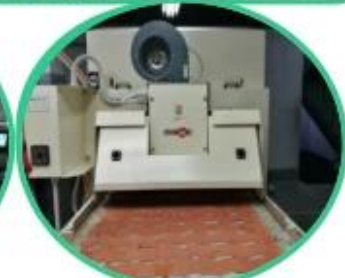
Glue Machine for Leather