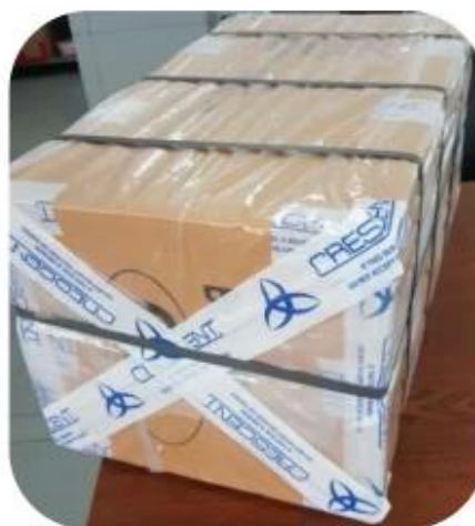
12.1 Final Packaged in Carton