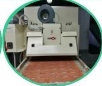
Glue Machine for Leather