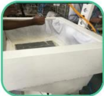
Glue Machine for Lining