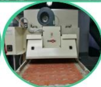
Glue Machine for Leather