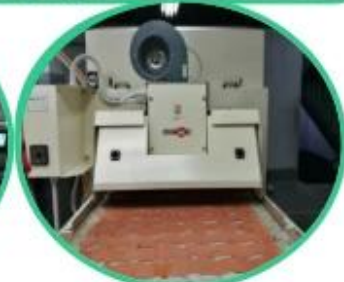
Glue Machine for Leather