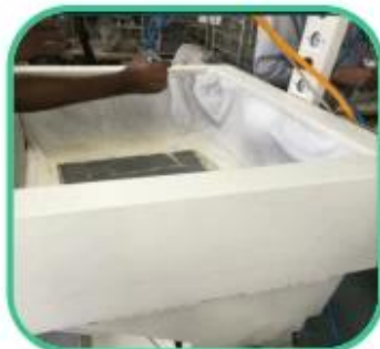
Glue Machine for Lining