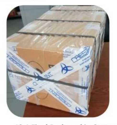
12.1 Final Packaged in Carton