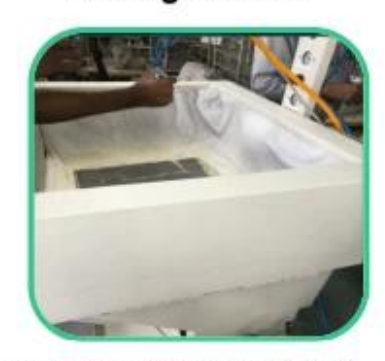
Glue Machine for Lining