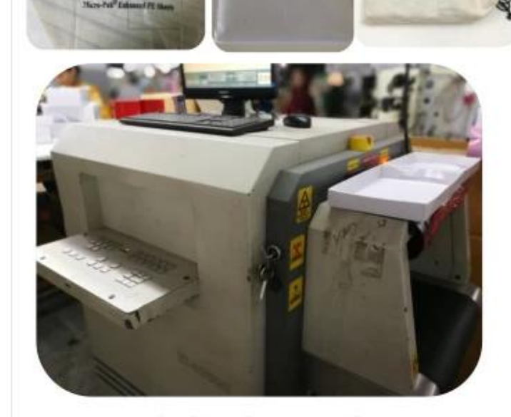
11.1 Finished Products Metal X-ray Detector